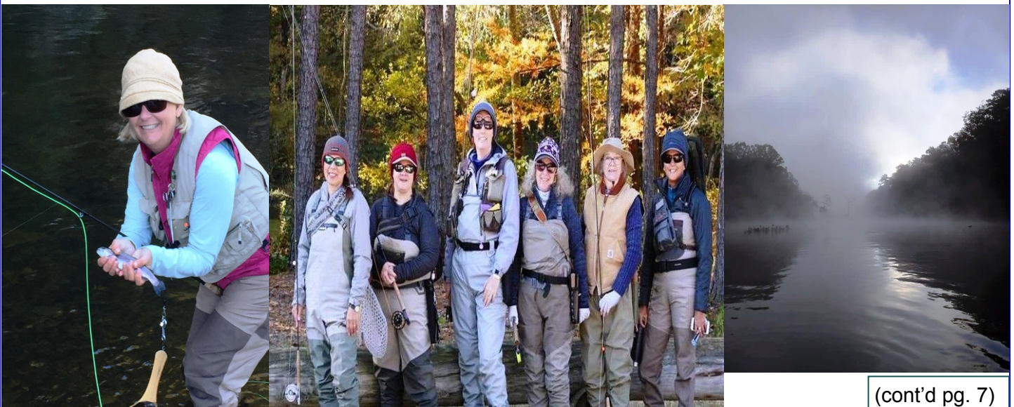
(cont'd pg. 7)