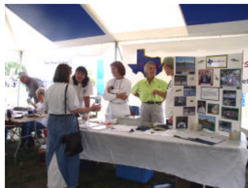
TWFF at EXPO